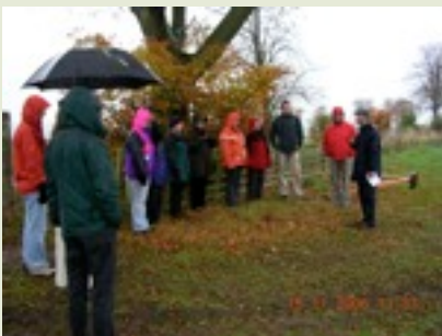
A rainy walk post-Pillars lunch