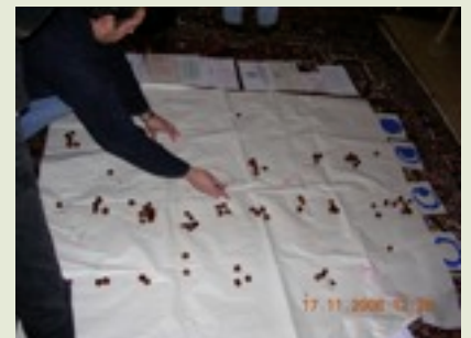
Our own indicators of success