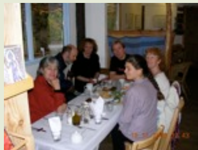
A rainy walk post-Pillars lunch